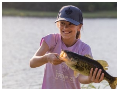
My First Fish