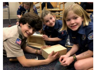
# A Scout is HELPFUL