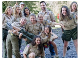
Class of 2024 Eagle Scouts!