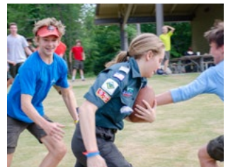
Tag Football @ Grimes