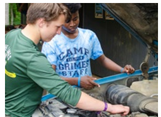
Scouting is Learning