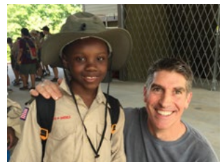
First Year at Camp