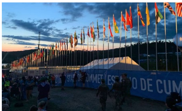
Sunrise at Jamboree 2019

The 24th World Scout Jamboree was held at the Summit Bechtel Family National Scout Reserve in West Virginia this summer. The theme was Unlock a New World. There were 152 countries represented with over 45,000 Scouts and staff attending. This is the first World Scout Jamboree held on U.S. soil since 1967. Scouts from across Mecklenburg County enjoyed a trip of a lifetime!