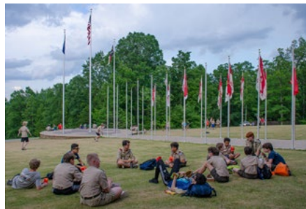
Flag Plaza & Patriot's Point