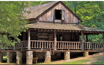
The Beautiful Camp Grimes

286 acres open year-round for camping, training, and programs, located 30 minutes from Charlotte