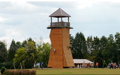
Belk Scout Camp